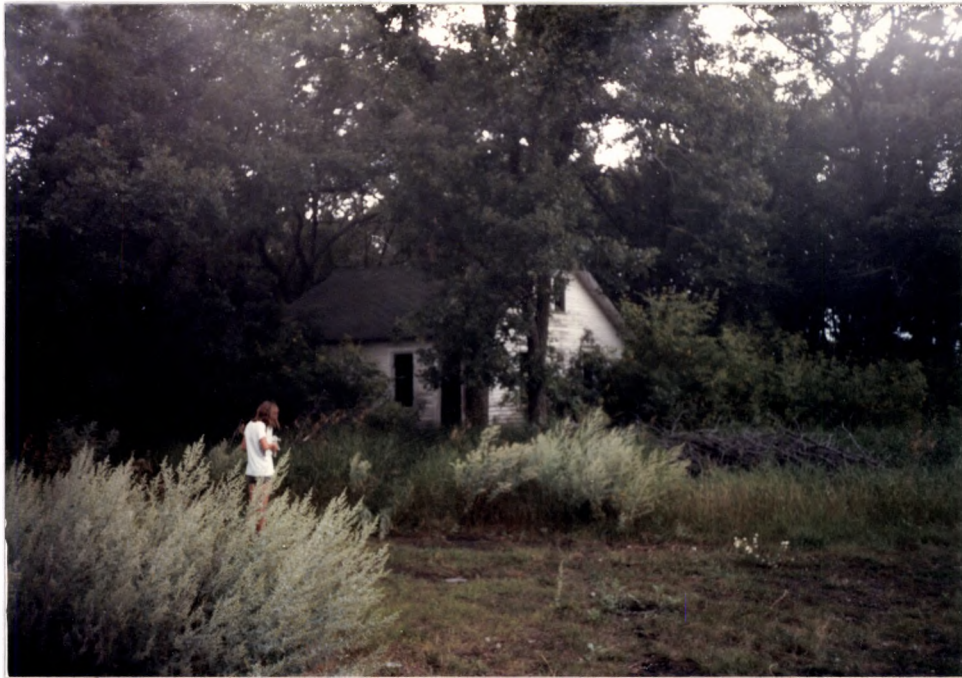
LT295, FEATURE 1, VIEW TO NORTHWEST (ROLL 16, FRAME 13, COLOR PHOTO, NEGATIVE STORED AT LARSON-TIBESAR ASSOCIATES)