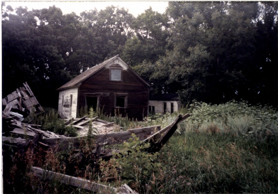
LT295, FEATURES 5 AND 2, VIEW TO NORTH (ROLL 16, FRAME 9, COLOR PHOTO, NEGATIVE STORED AT LARSON-TIBESAR ASSOCIATES)