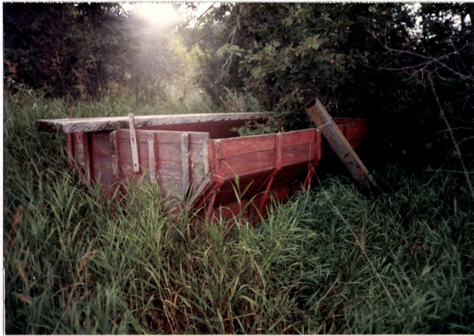
LT295, FEATURE 6, VIEW TO WEST (ROLL 16, FRAME 12, COLOR PHOTO)