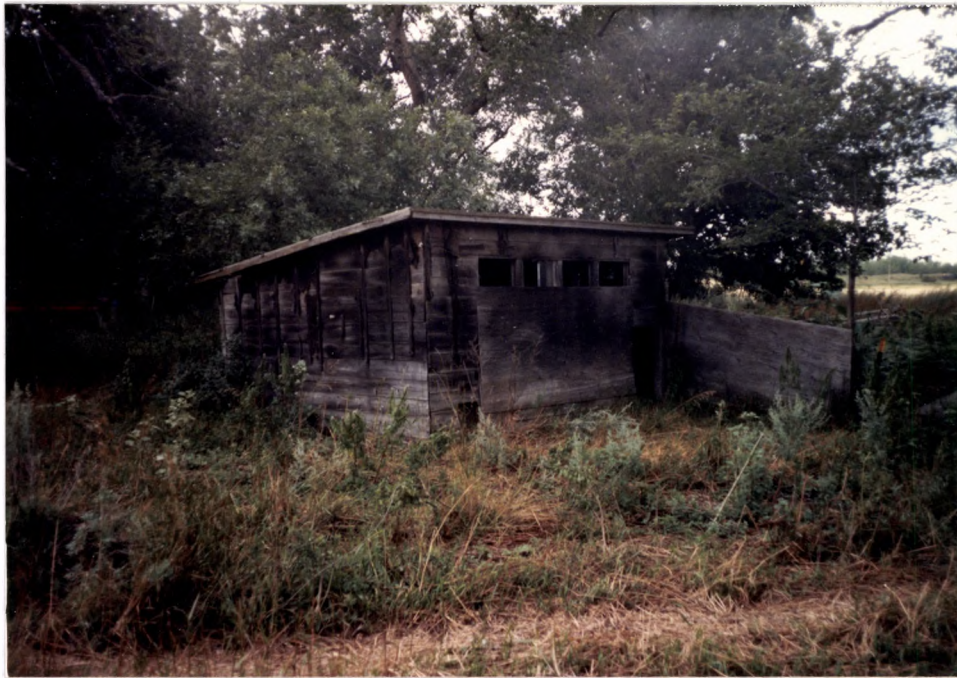
LT295, FEATURE 3, VIEW TO NORTHEAST (ROLL 16, FRAME 10, COLOR PHOTO)