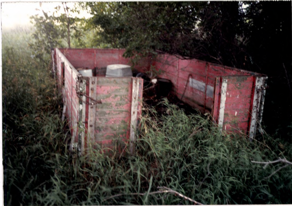
LT295, FEATURE 7, VIEW TO EAST (ROLL 16, FRAME 11, COLOR PHOTO, NEGATIVE STORED AT LARSON-TIBESAR ASSOCIATES)