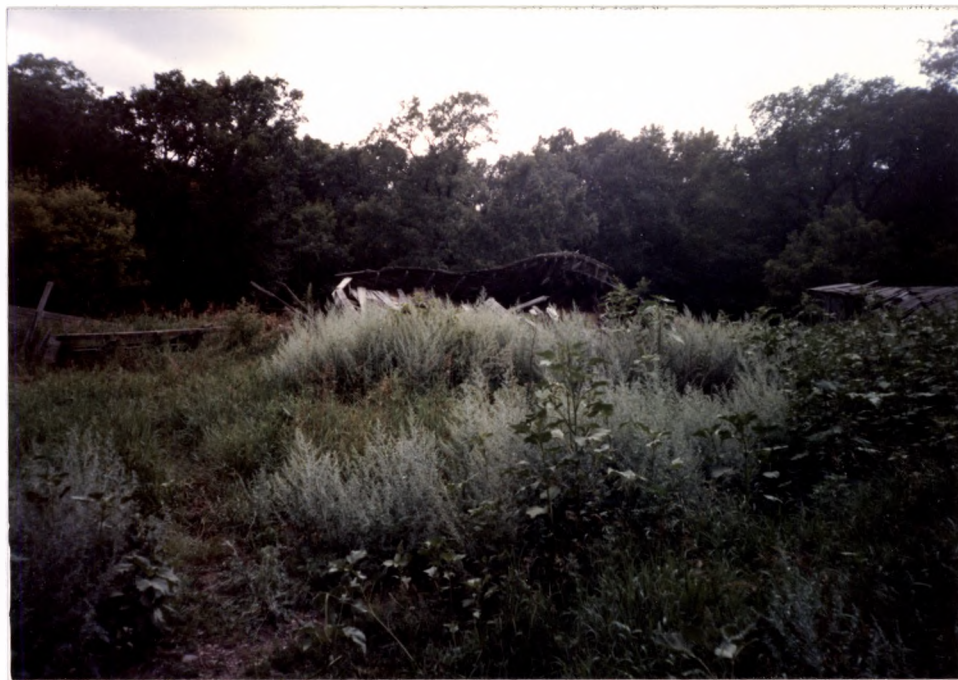
LT295, FEATURE 4, VIEW TO WEST (ROLL 16, FRAME 8, COLOR PHOTO, NEGATIVE STORED AT LARSON-TIBESAR ASSOCIATES)