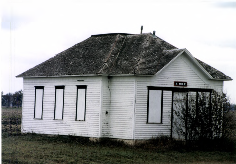
Schoolhouse closeup. View to the northeast. (Roll 1, neg. 5)

Include direction facing, feature number, and photo caption for each submitted photograph.