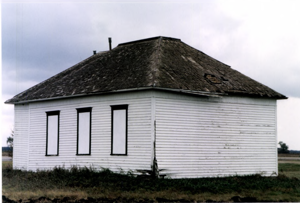
Schoolhouse closeup. View to the southwest. (Roll 1, neg. 11)

Include direction facing, feature number, and photo caption for each submitted photograph.