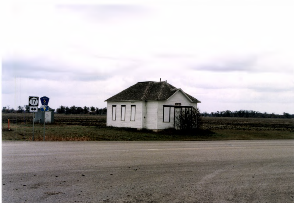
Schoolhouse overview. View to the northeast. (Roll 1, neg. 8)