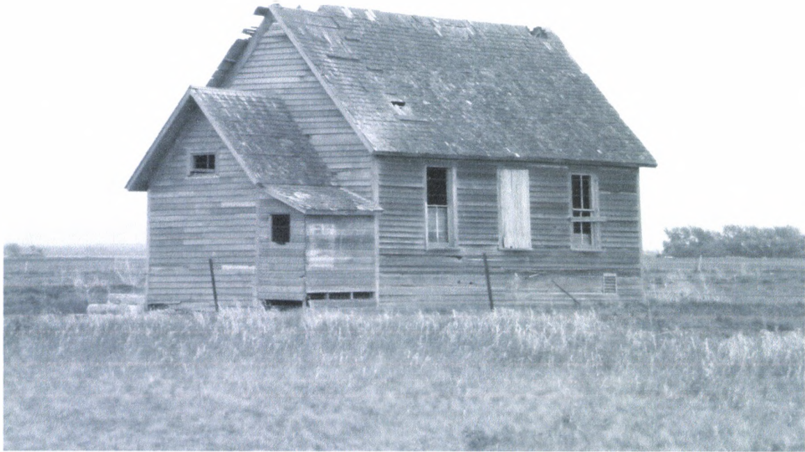
3 - Vesta Township School West side 5/21/2010 Kathy Wilner WA