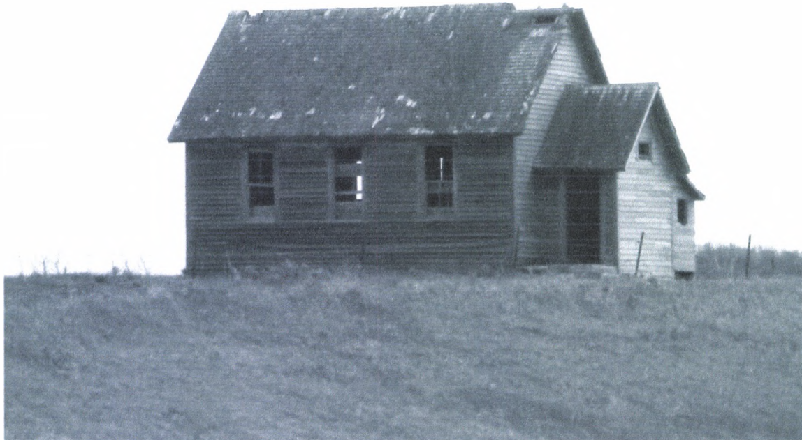
1 – Vesta Township School East side 5/21/2010 Kathy Wilner WA