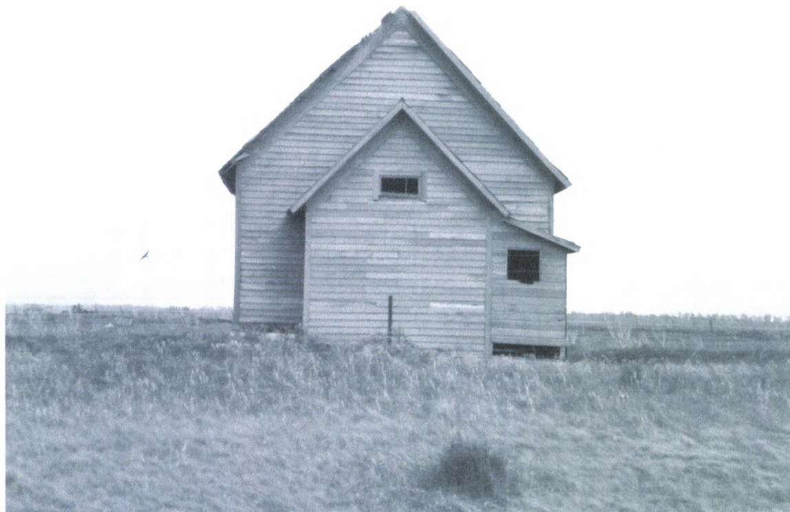
2 – Vesta Township School North side 5/21/2010 Kathy Wilner WA