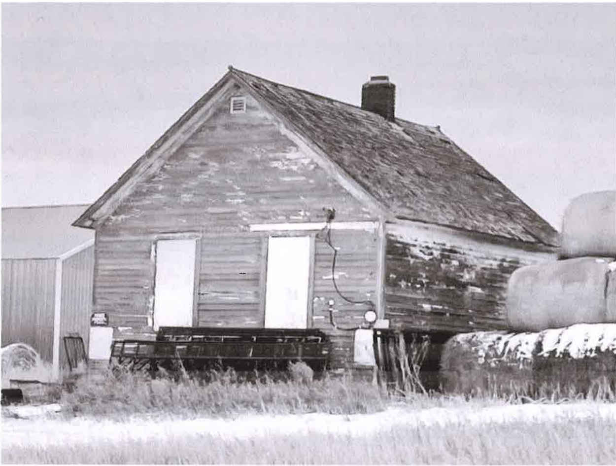
North and West Sides