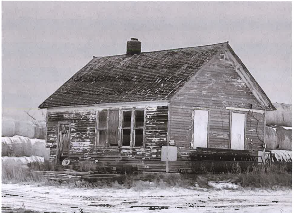
East and North Sides