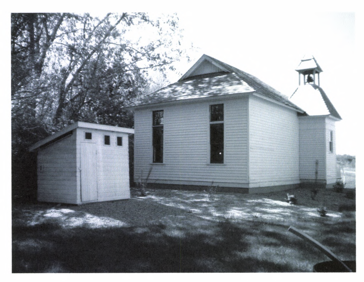
3 – St. Anna School #1