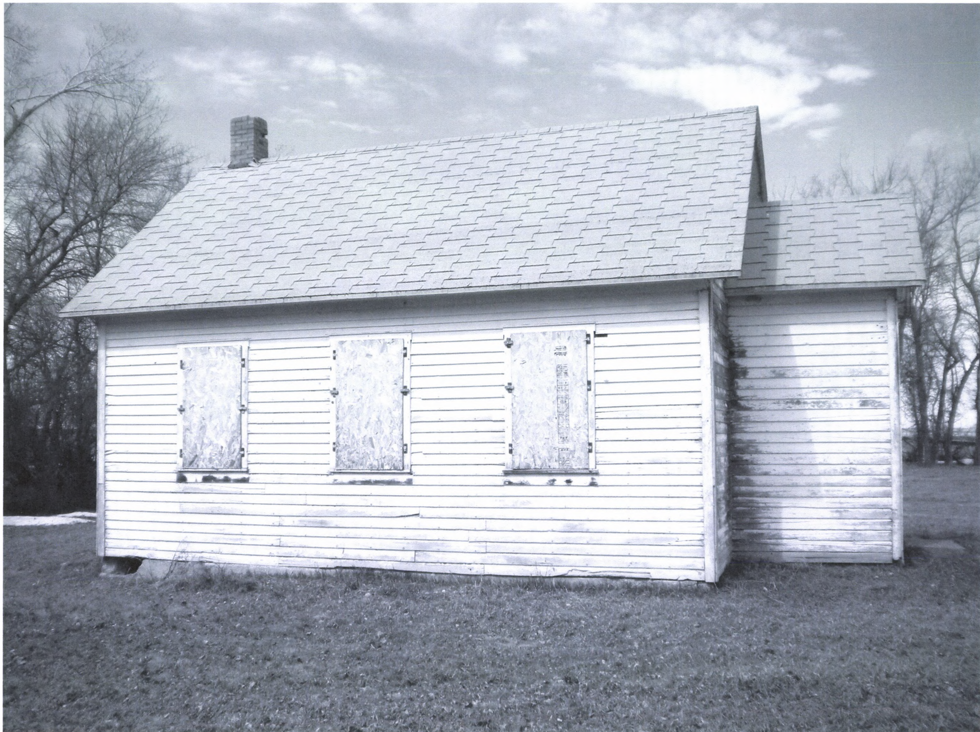
Johnson School #1