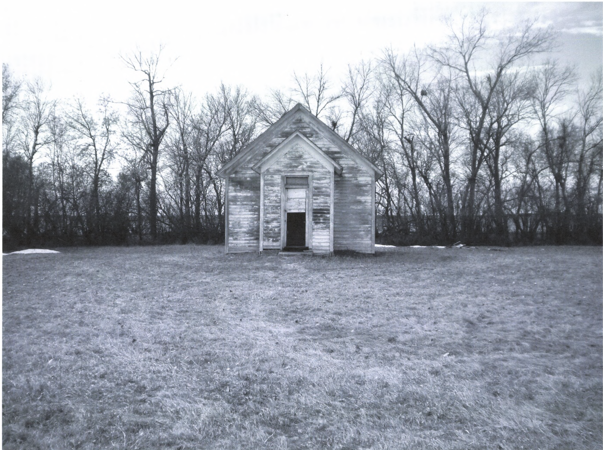
Johnson School #1