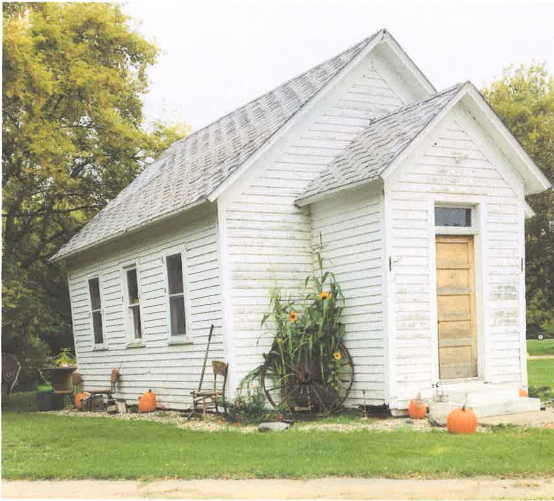
Southeast (front) and Southwest (windows) Sides