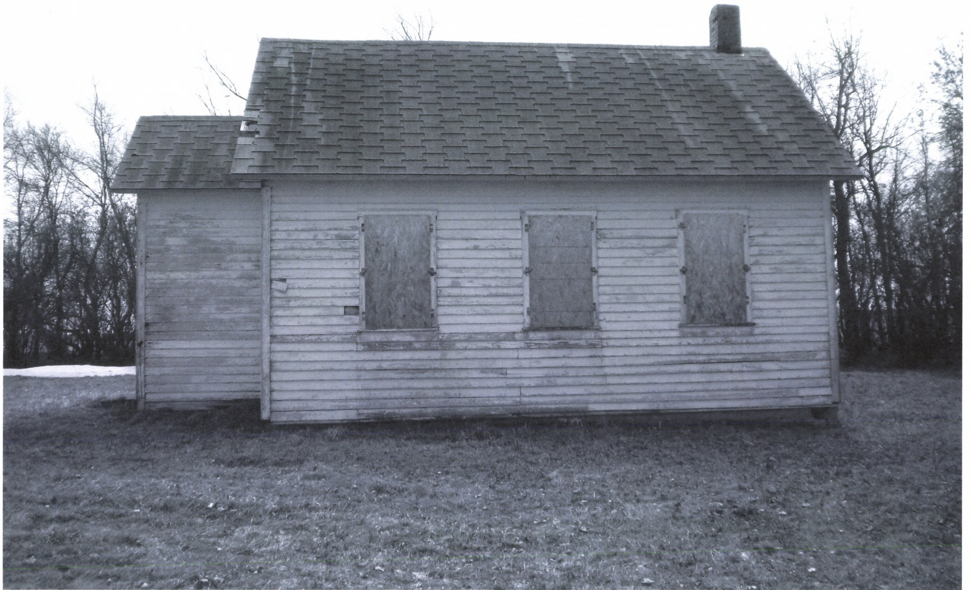
Johnson School #1