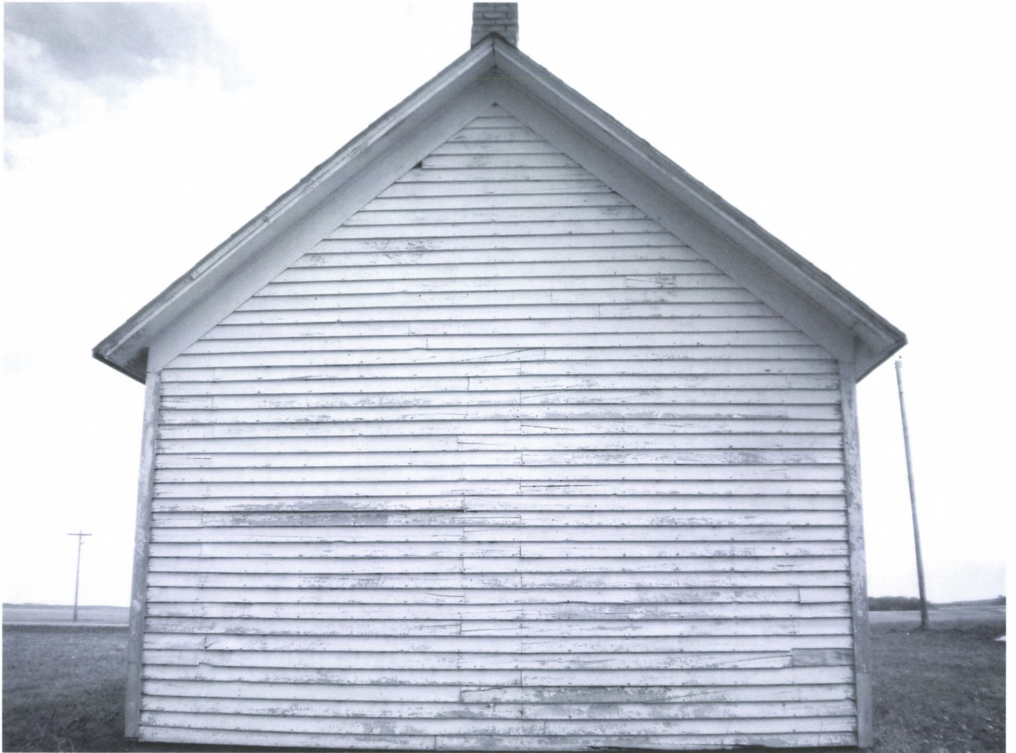
Johnson School #1 West Side.