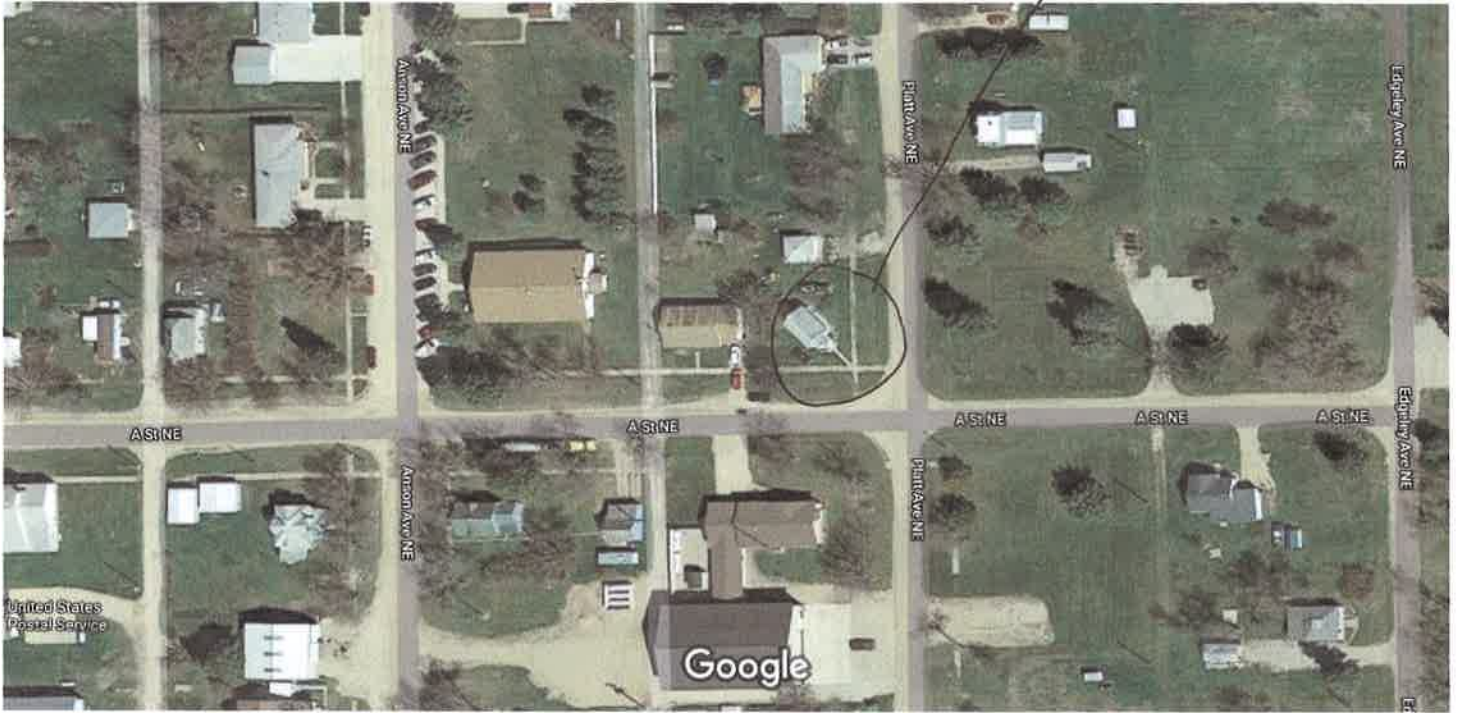
Imagery ©2021 Maxar Technologies, Map data ©2021 50 ft