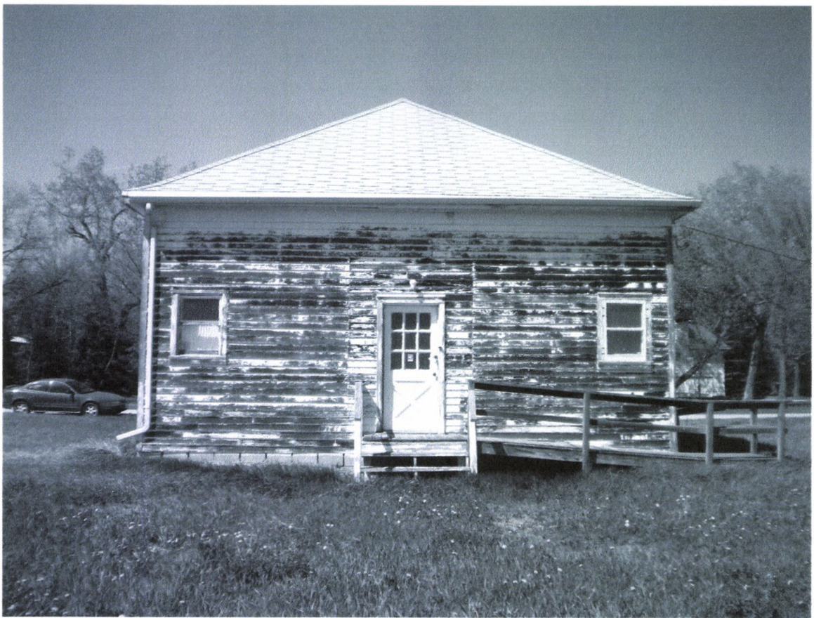
1. Antelope School #4 South side 5/18/2010 Kathy Wilner WE