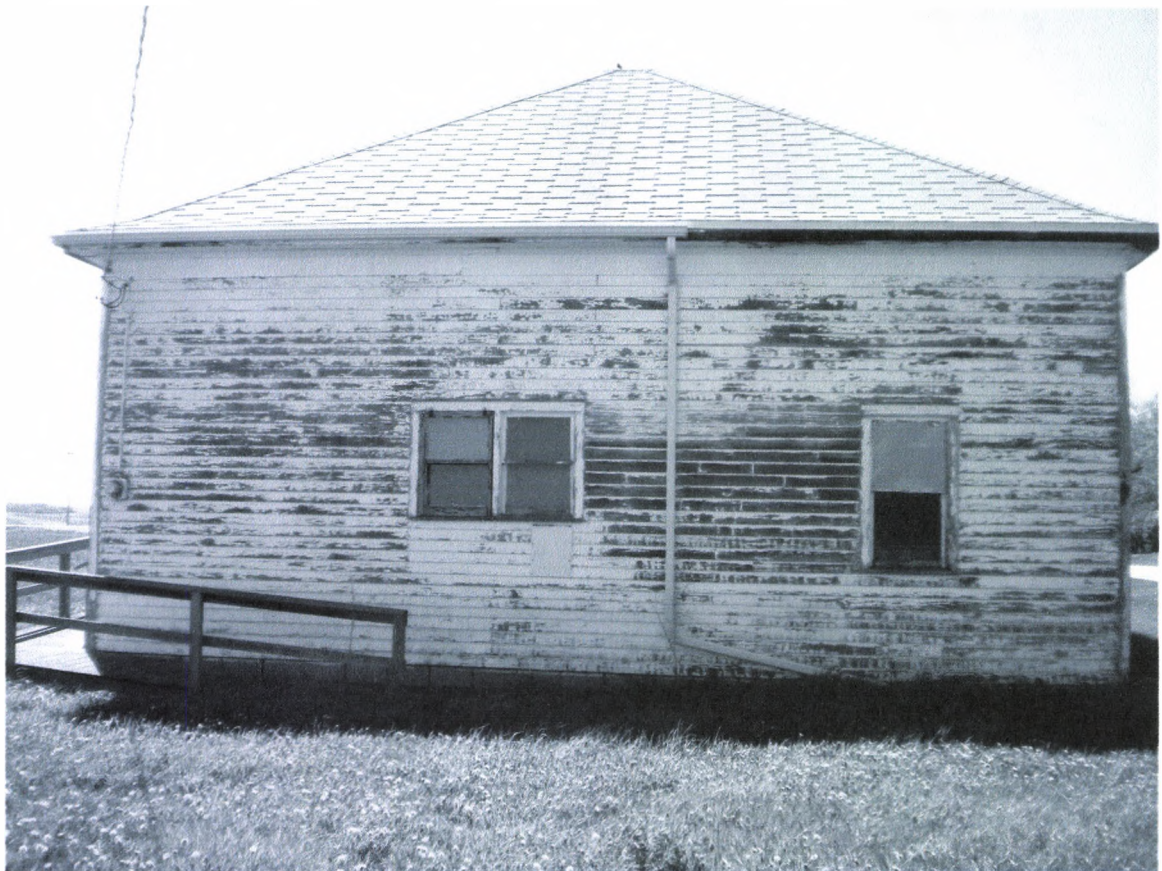
2. Antelope School #4 South side 5/18/2010 Kathy Wilner WE