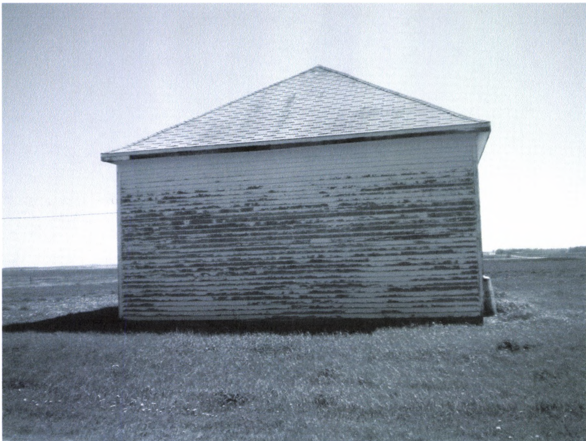
4. Antelope School #4 North side 5/18/2010 Kathy Wilner WE