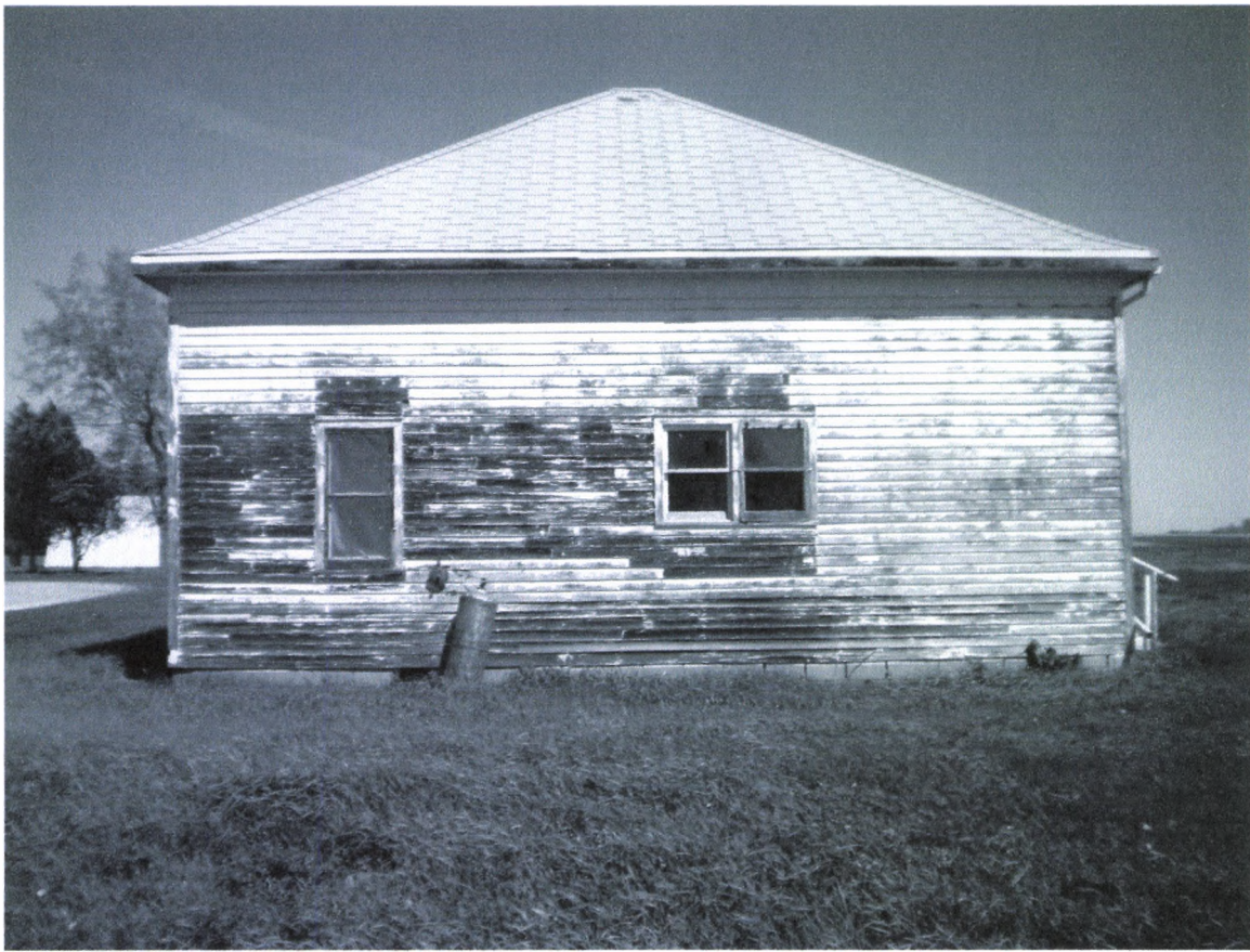
3. Antelope School #4 West side 5/18/2010 Kathy Wilner WE