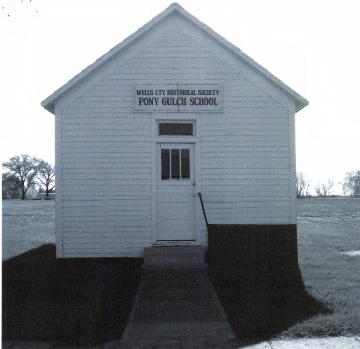
1 - Pony Gulch School #1 West side 5/19/2010 Kathy Wilner WE 2 - Pony Gulch School #1 North side 5/19/2010 Kathy Wilner WE