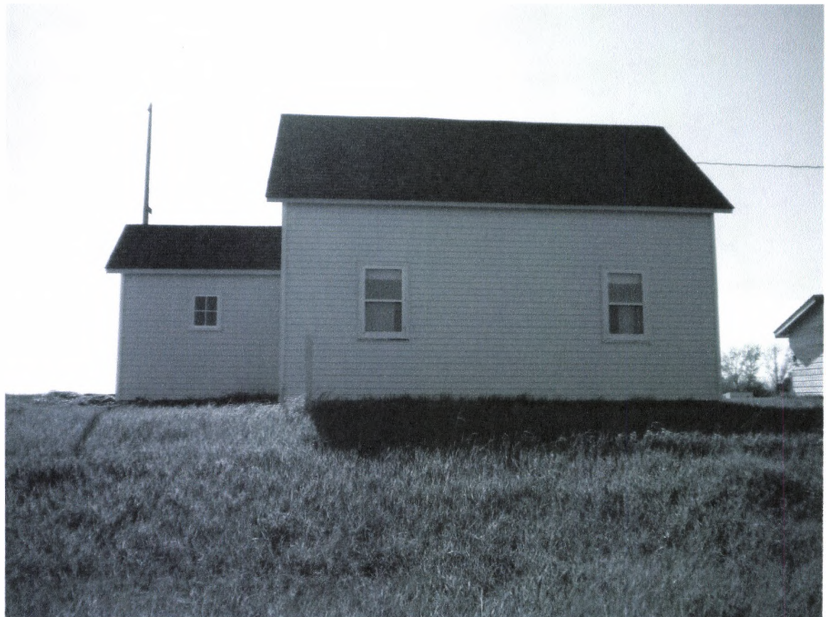
2 – Pony Gulch School #2 East side 5/18/2010 Kathy Wilner WE