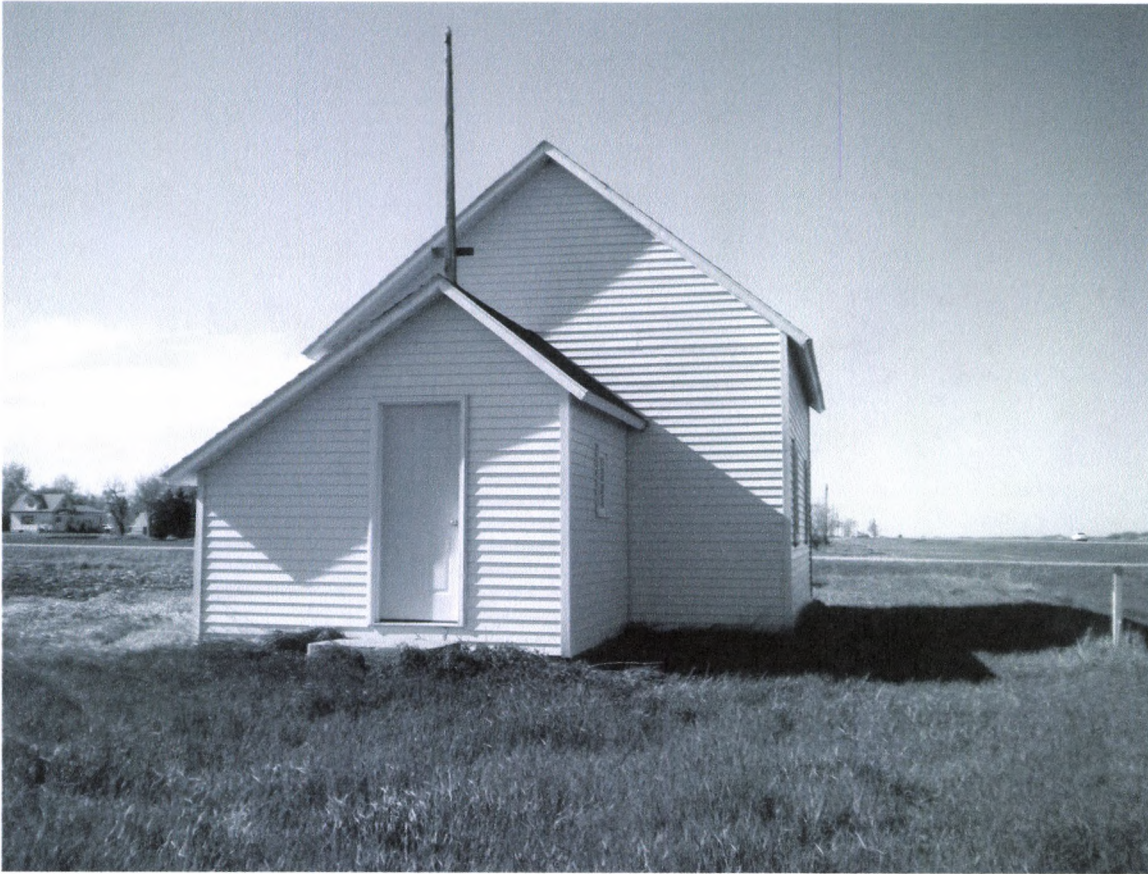
1 – Pony Gulch School #2 South side 5/18/2010 Kathy Wilner WE