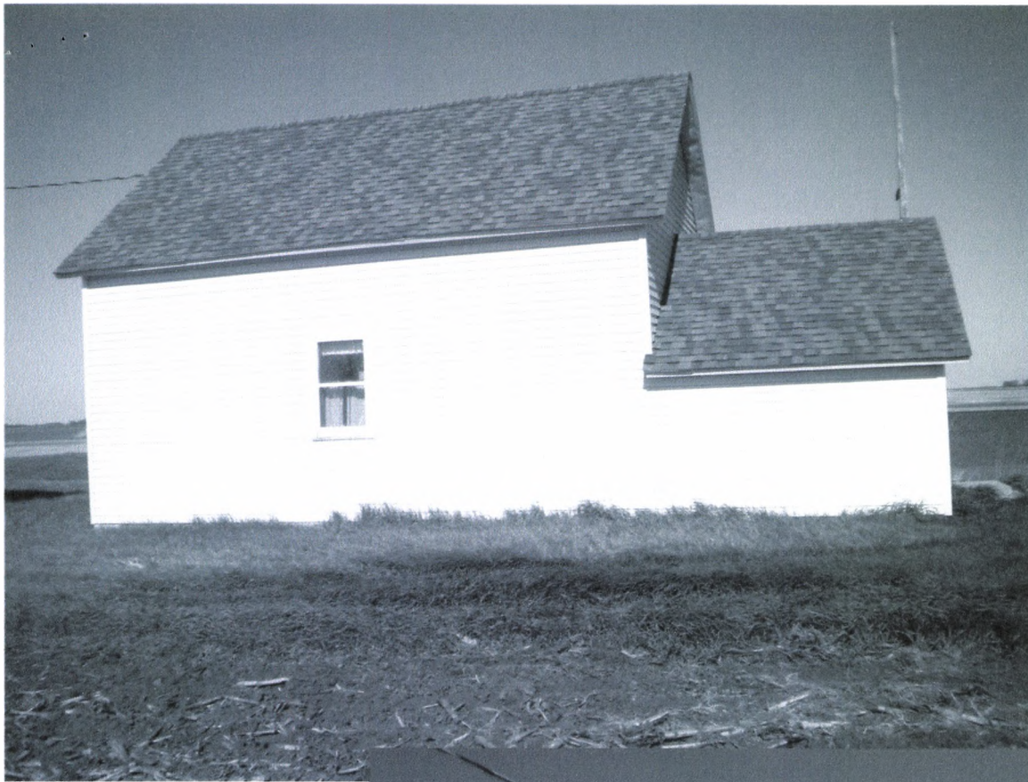
Pony Gulch School #2