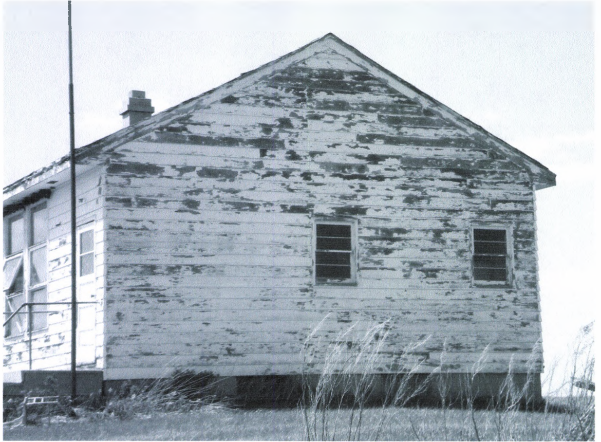
3 – Crystal Lake Township School East side 5/19/2010 Kathy Wilner WE