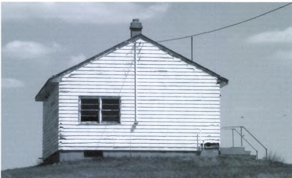
2 – Crystal Lake Township School West side 5/19/2010 Kathy Wilner WE