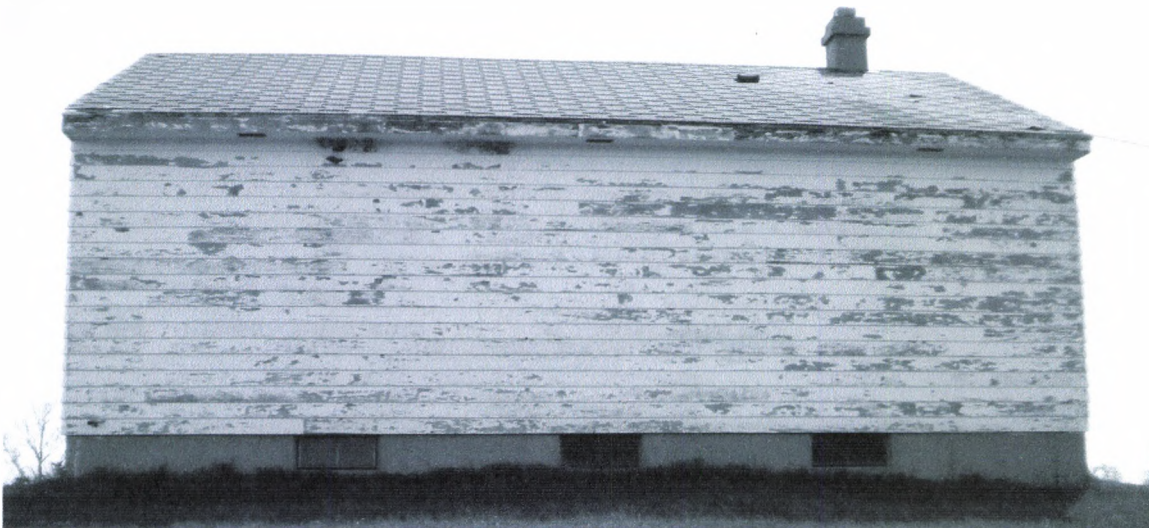
4 – Crystal Lake Township School North side 5/19/2010 Kathy Wilner WE