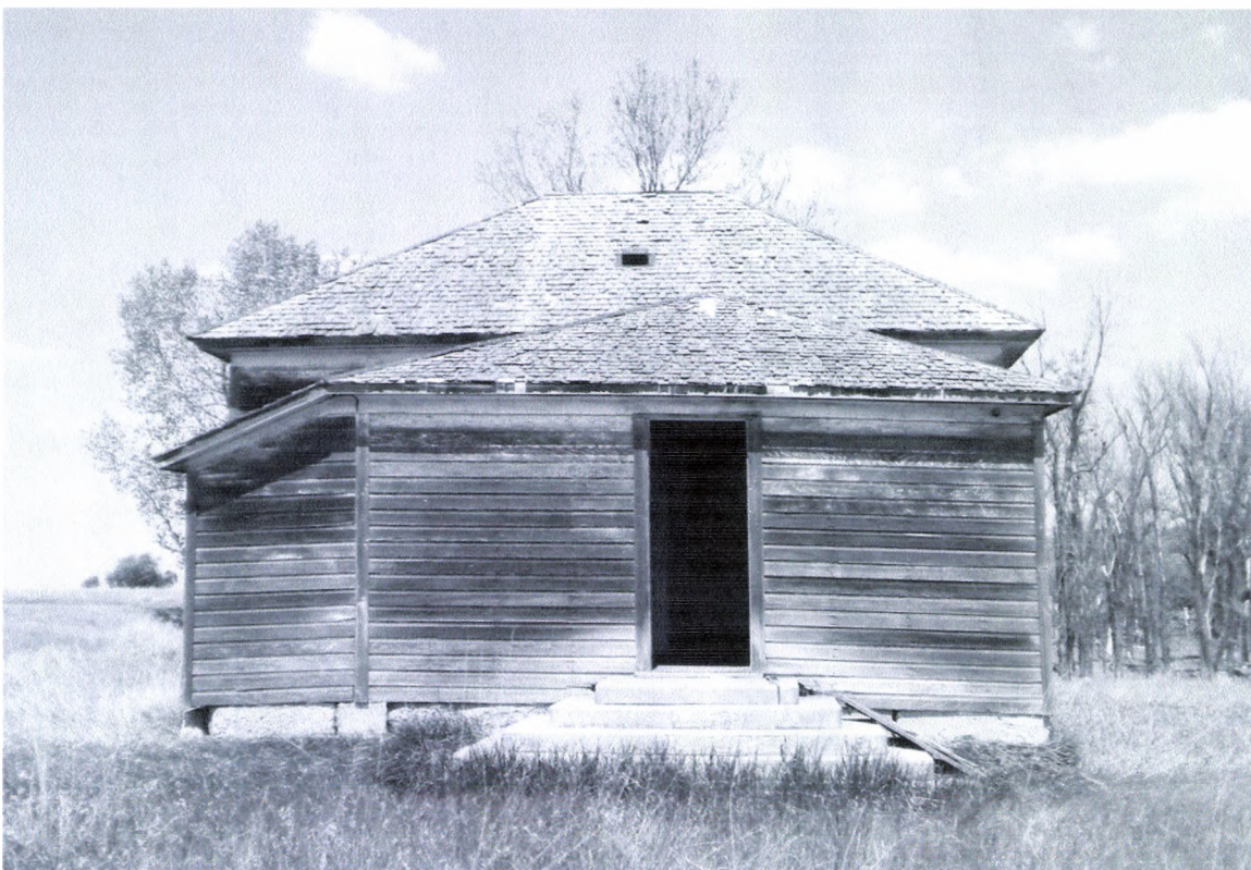
2 - Hillsdale Township School #3 South side 5/19/2010 Kathy Wilner WE