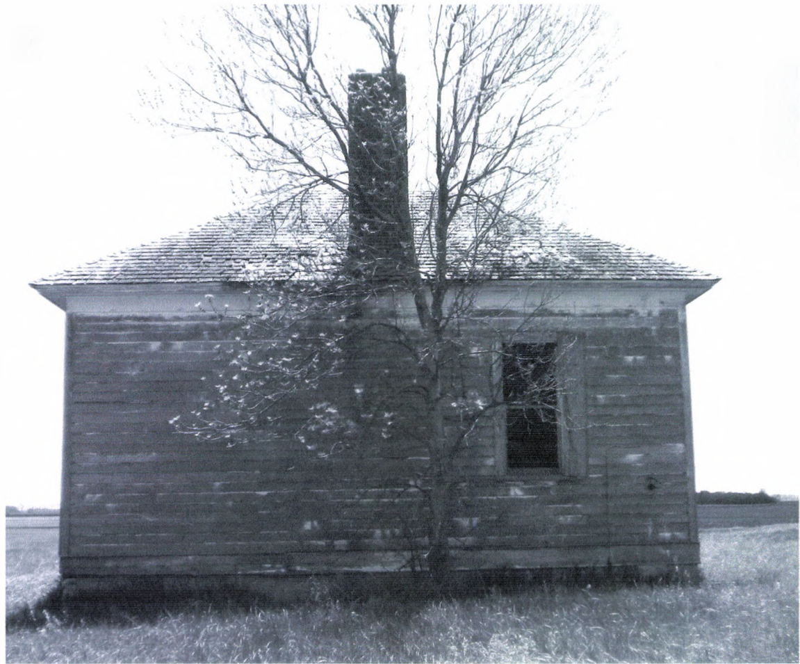
3 - Hillsdale Township School# 3 North side 5/19/2010 Kathy Wilner WE