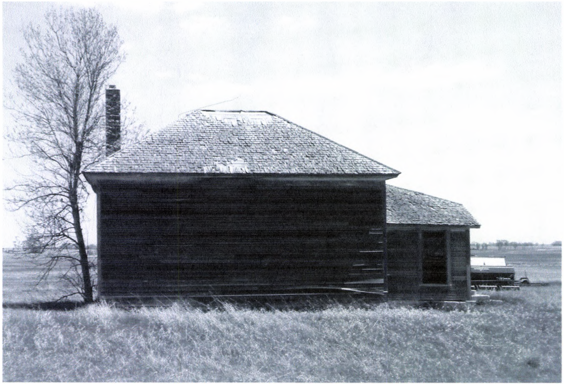
1 - Hillsdale Township School #3 West side 5/19/2010 Kathy Wilner WE