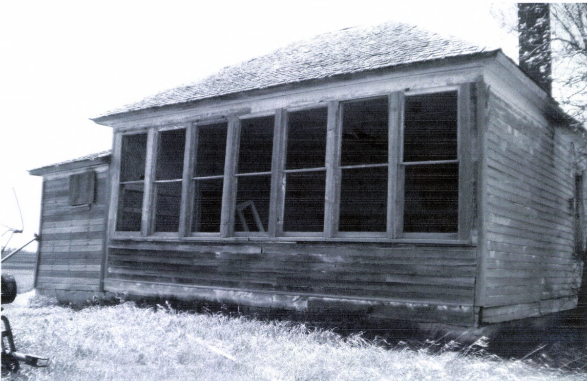
4 - Hillsdale Township School# 3 East side 5/19/2010 Kathy Wilner WE