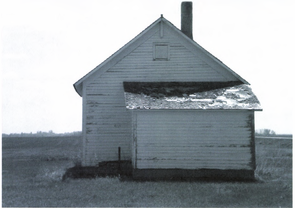
1 – Western Township School North side 5/19/2010 Kathy Wilner WE