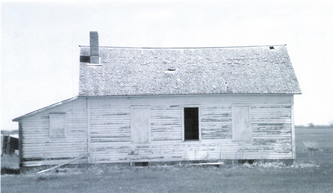
2 – Western Township School West side 5/19/2010 Kathy Wilner WE