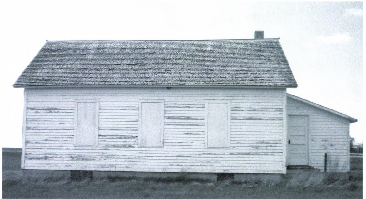
3 - Western Township School East side 5/19/2010 Kathy Wilner WE