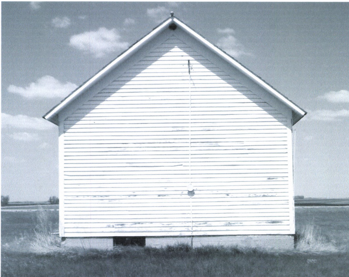
4 - Western Township School South side 5/19/2010 Kathy Wilner WE