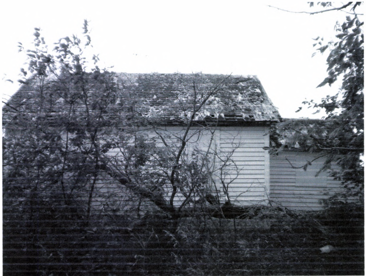
3 – Myron Thon School North side 9/22/2010 Kathy Wilner WE