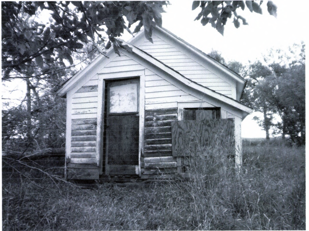
1 – Myron Thon School West side 9/22/2010 Kathy Wilner WE