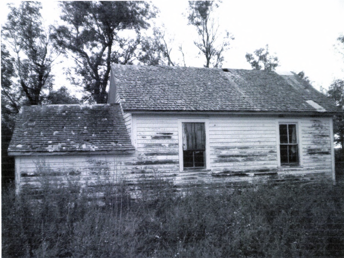
2 – Myron Thon School South side 9/22/2010 Kathy Wilner WE