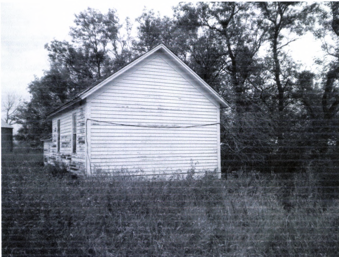
4 – Myron Thon School East side 9/22/2010 Kathy Wilner WE