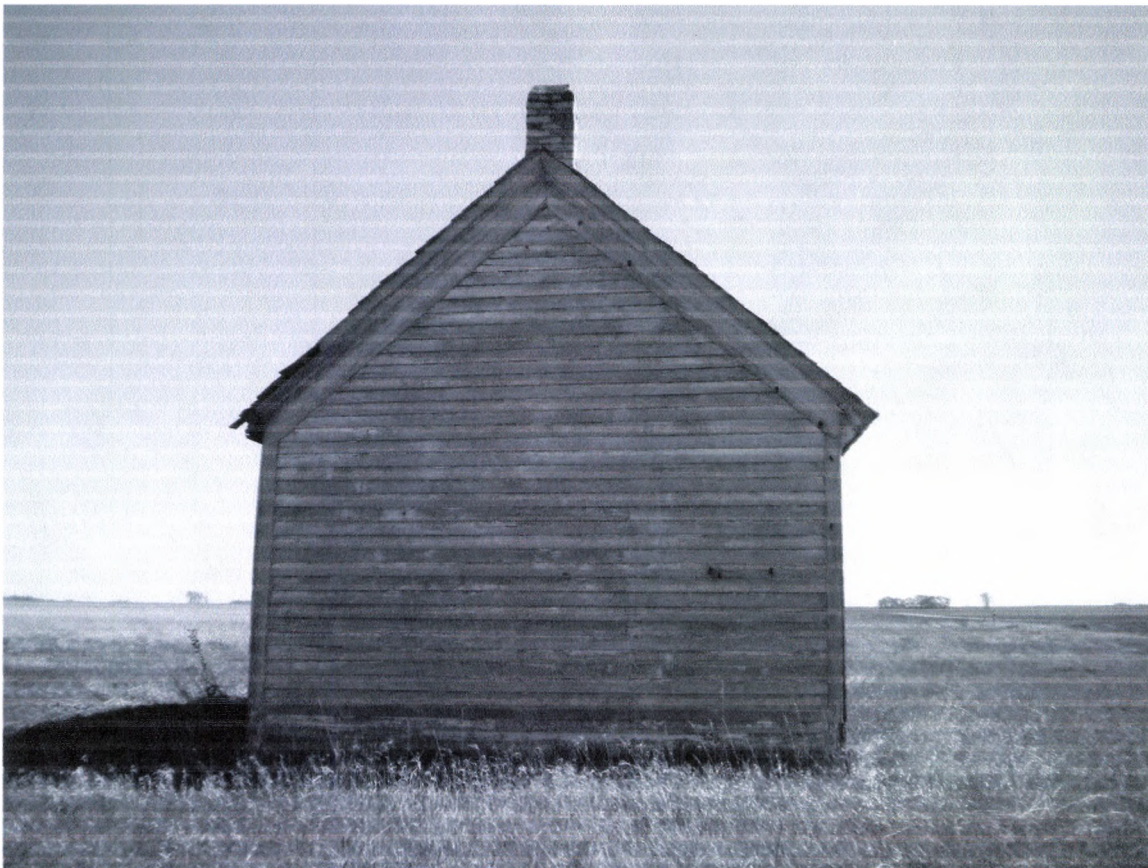
4 – Eigenham School #1 North sidee 9/23/2010 Kathy Wilner WE