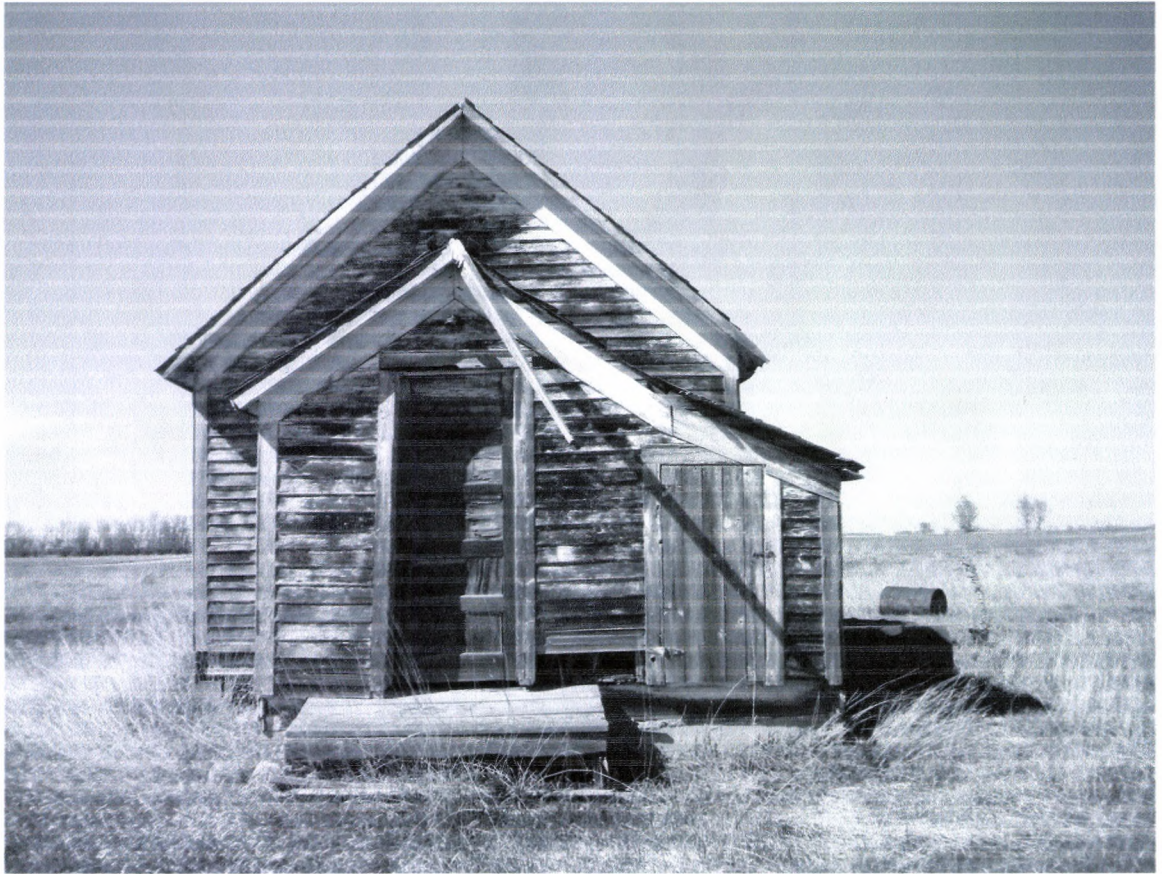
1 – Eigenham School #1 South side 9/23/2010 Kathy Wilner WE