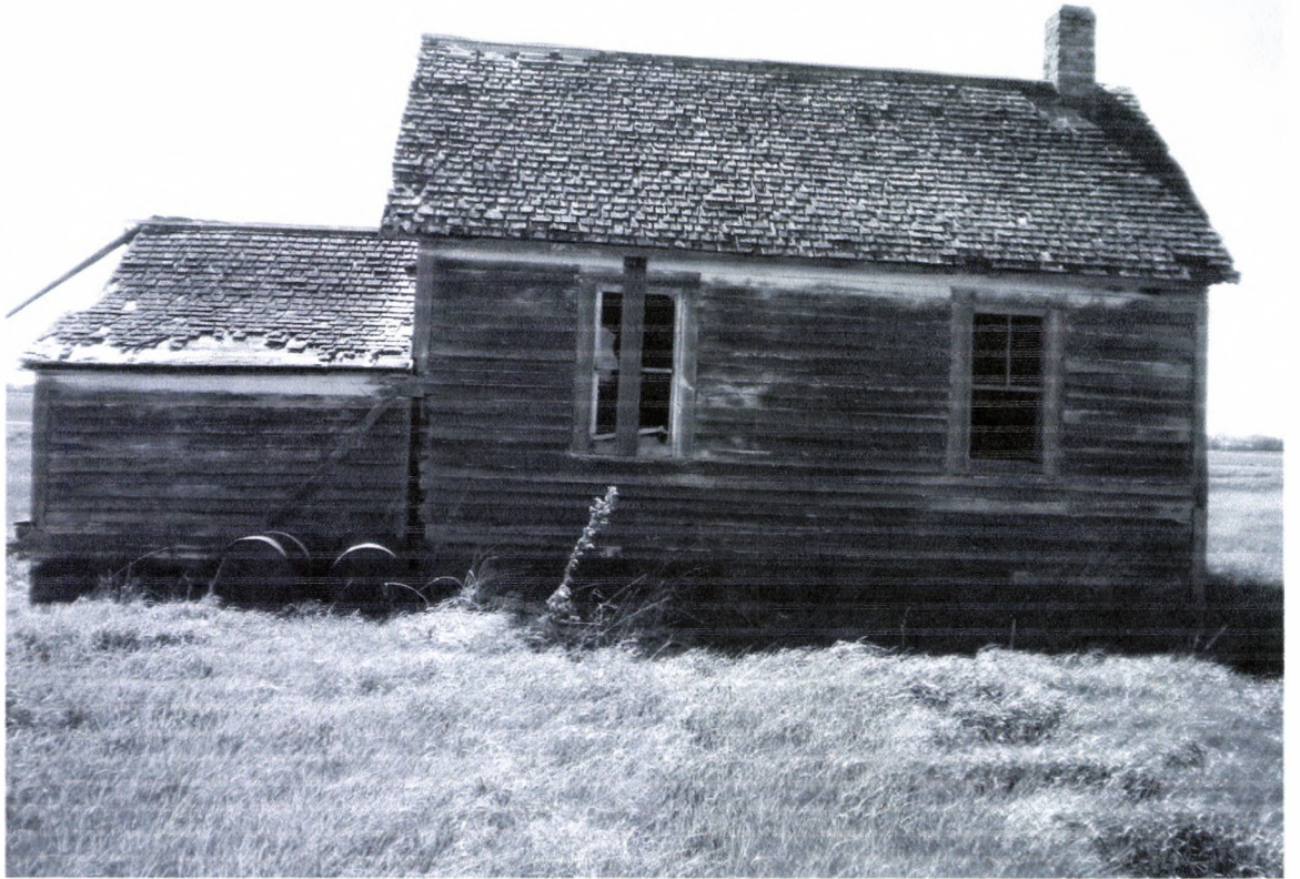
3 – Eigenham School #1 East side 9/23/2010 Kathy Wilner WE