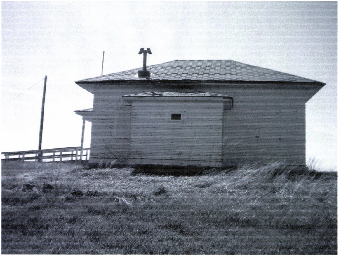
Eigenham School #5 East side 9/23/2010 Kathy Wilner WE