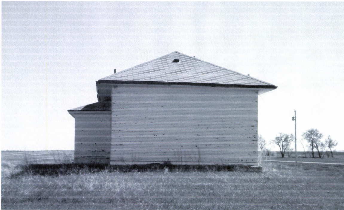
Eigenham School #5 North side 9/23/2010 Kathy Wilner WE