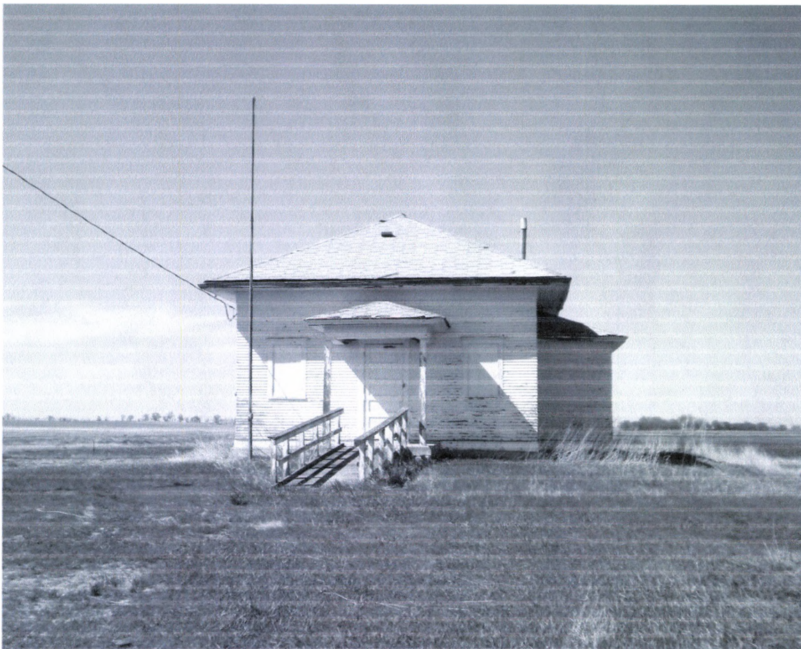
Eigenham School #5 South side 9/23/2010 Kathy Wilner WE