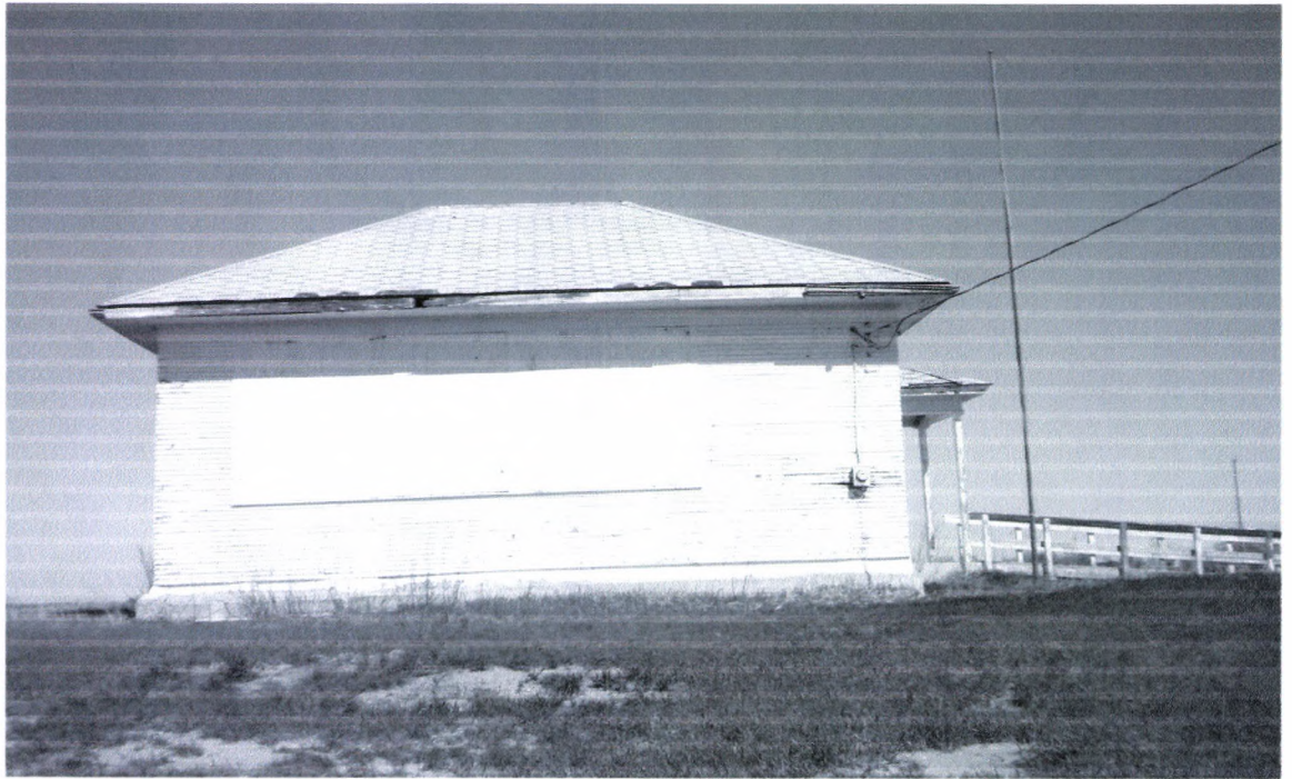
Eigenham School #5 West side 9/23/2010 Kathy Wilner WE