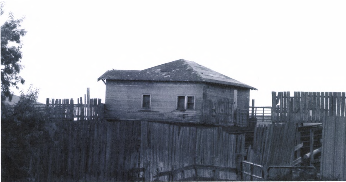
West Side (To the right)