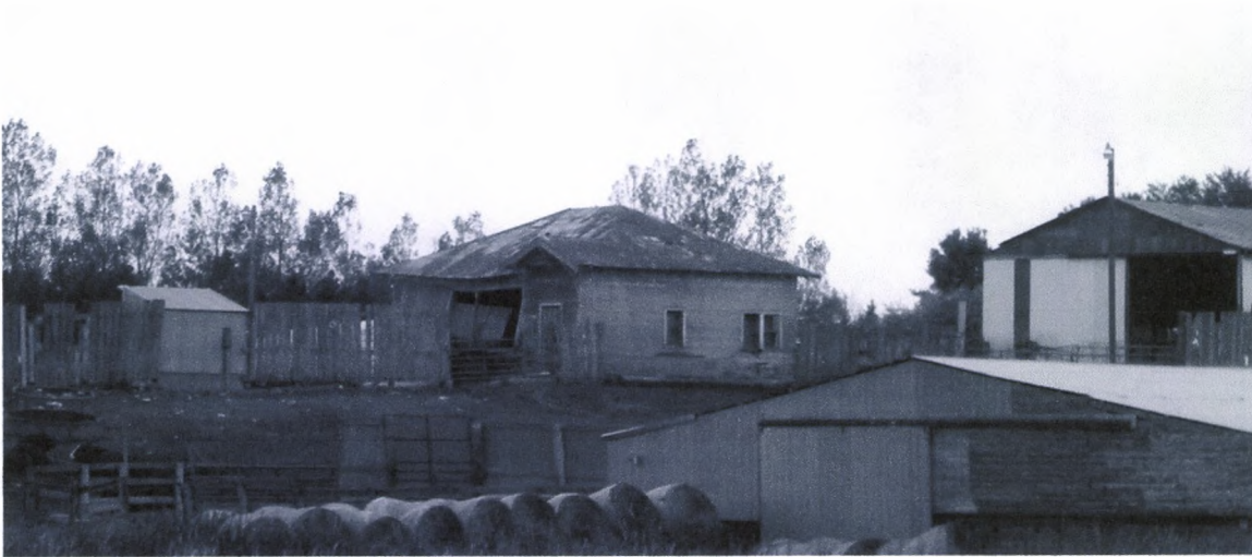
Northeast Corner (showing the east and south side)

Silver Lake Township School 9/6/2012 Kathy Wilner WE