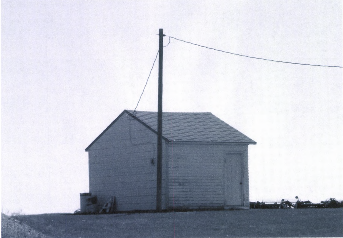
Eddy School #1 – Porch East and North Sides 5/18/2010 Kathy Wilner WE