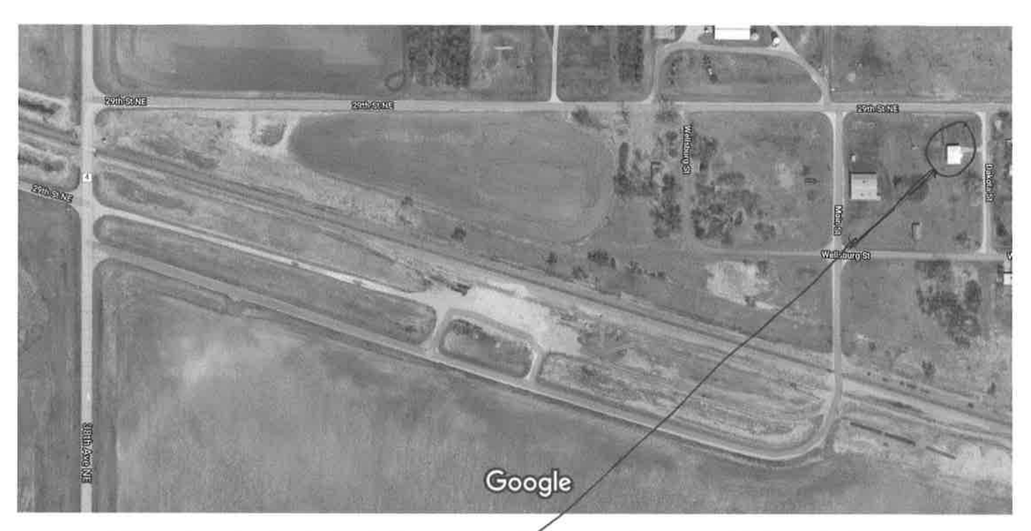
Imagery ©2021 Maxar Technologies, USDA Farm Service Agency, Map data ©2021 200 ft