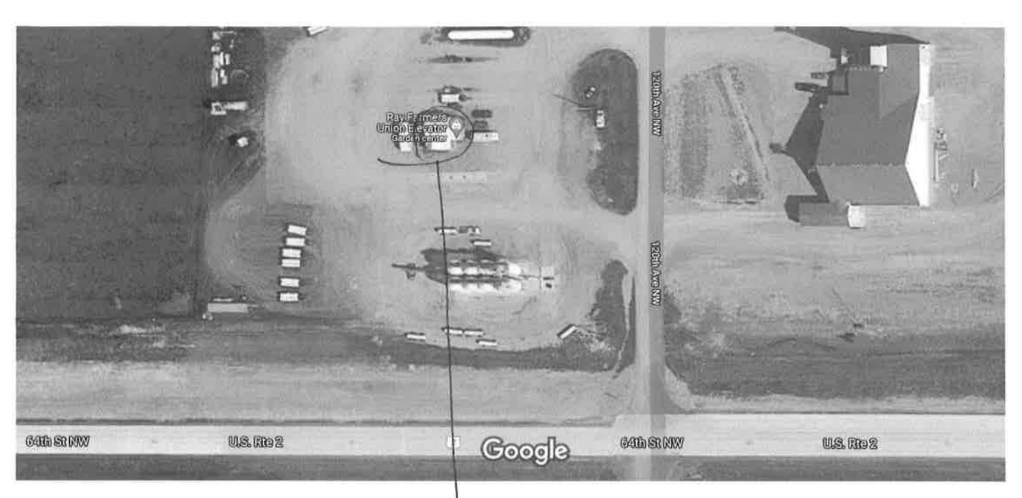
Imagery ©2021 Maxar Technologies, Map data ©2021 50 ft