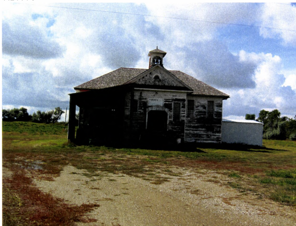
Feature 1. East façade. Looking west. September 20, 2011.