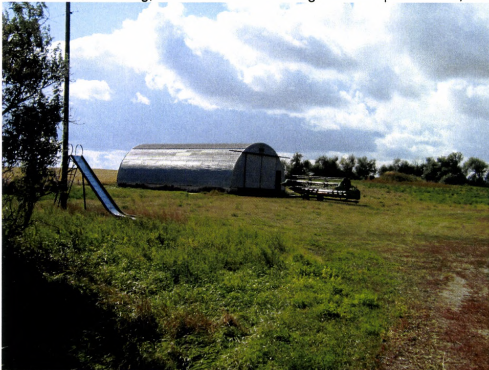
Feature 2. East elevation and north façade. Looking southwest. September 20, 2011.