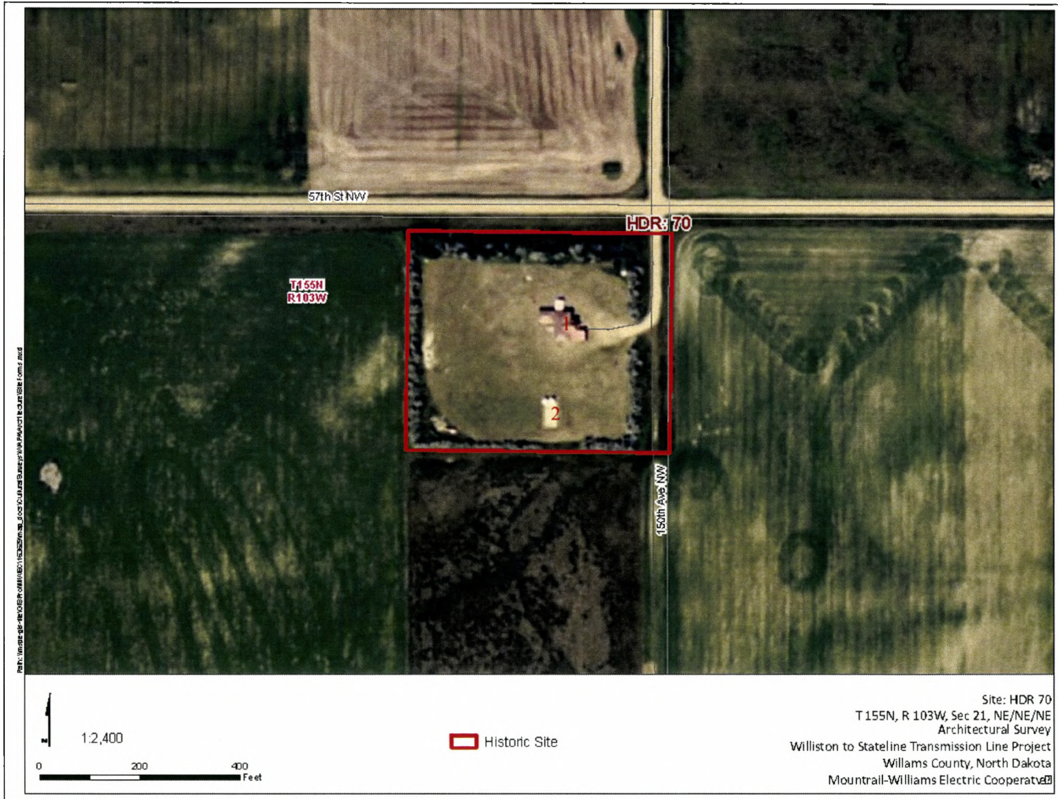
Site sketch map with numbered features.