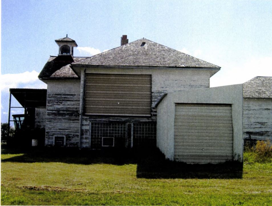
Feature 1. North elevation. Looking south. September 20, 2011.