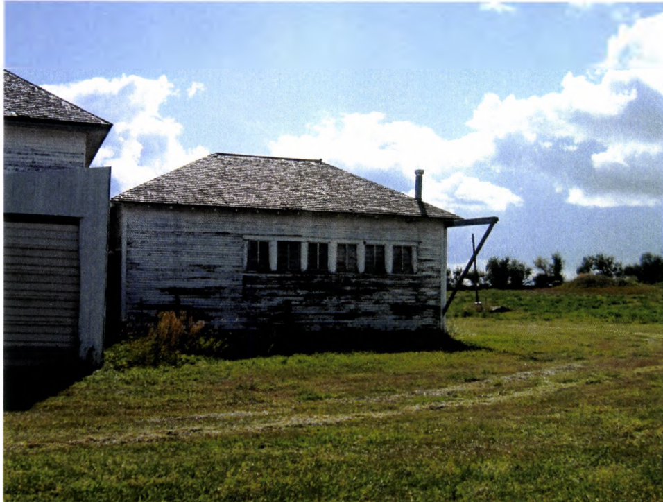
Feature 1. West building, north elevation. Looking south. September 20, 2011.