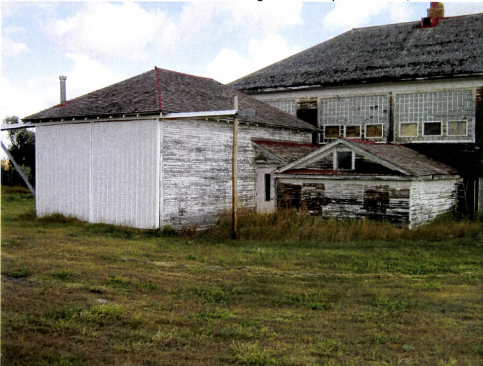
Feature 1. North elevation, north portion. Looking southeast. September 20, 2011.