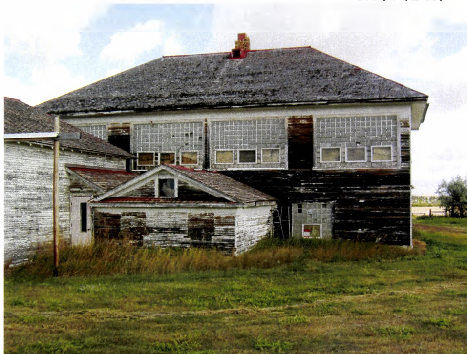
Feature 1. North elevation, south portion. Looking south. September 20, 2011.