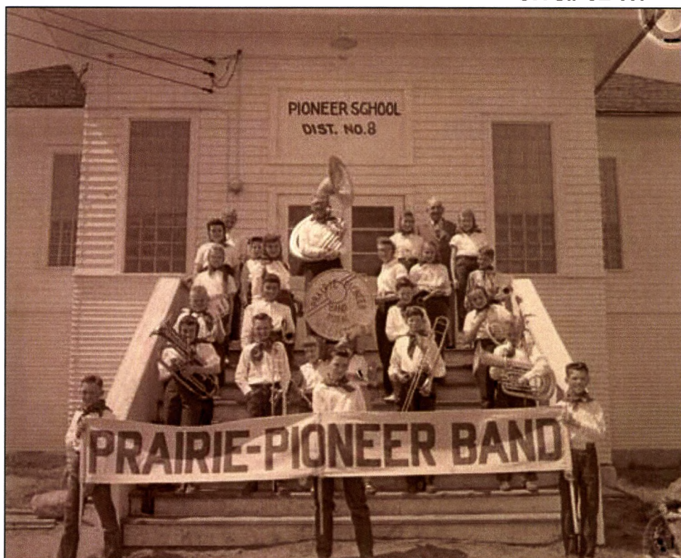
The Pioneer School as it appeared in circa 1957.