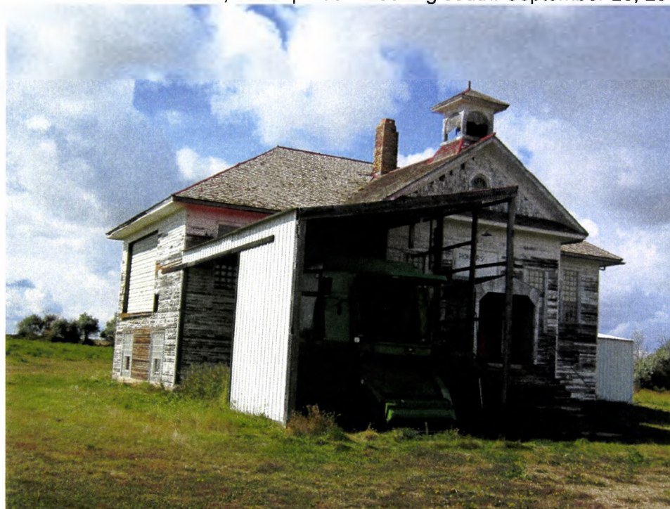
Feature 1. South elevation and east façade. Looking northwest. September 20, 2011.