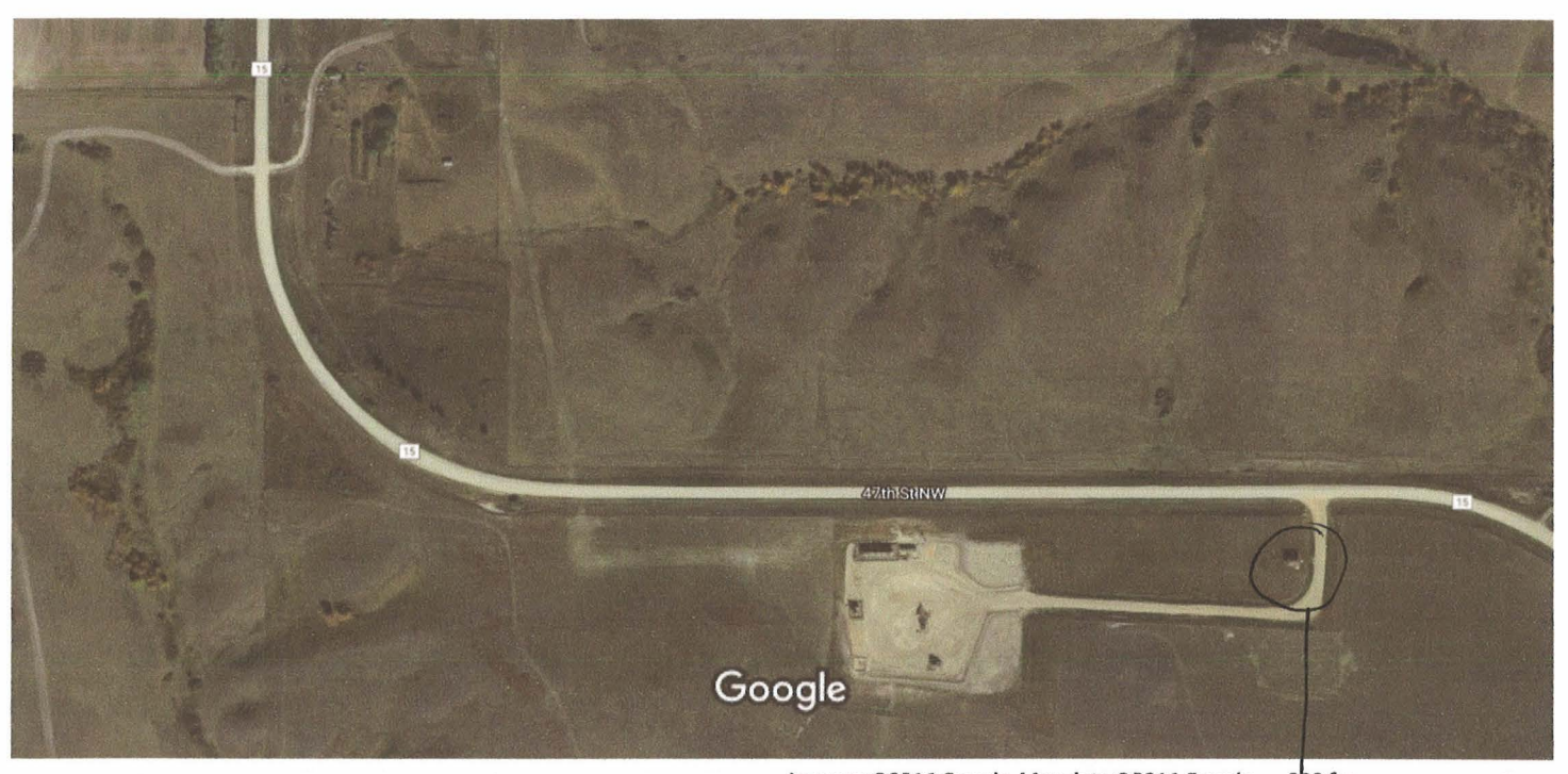
#15 is also 192nd are NW