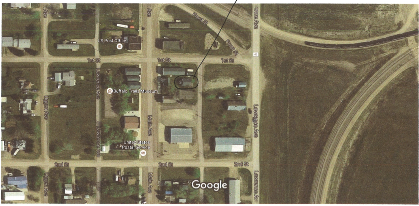
Imagery ©2016 Google, Map data ©2016 Google