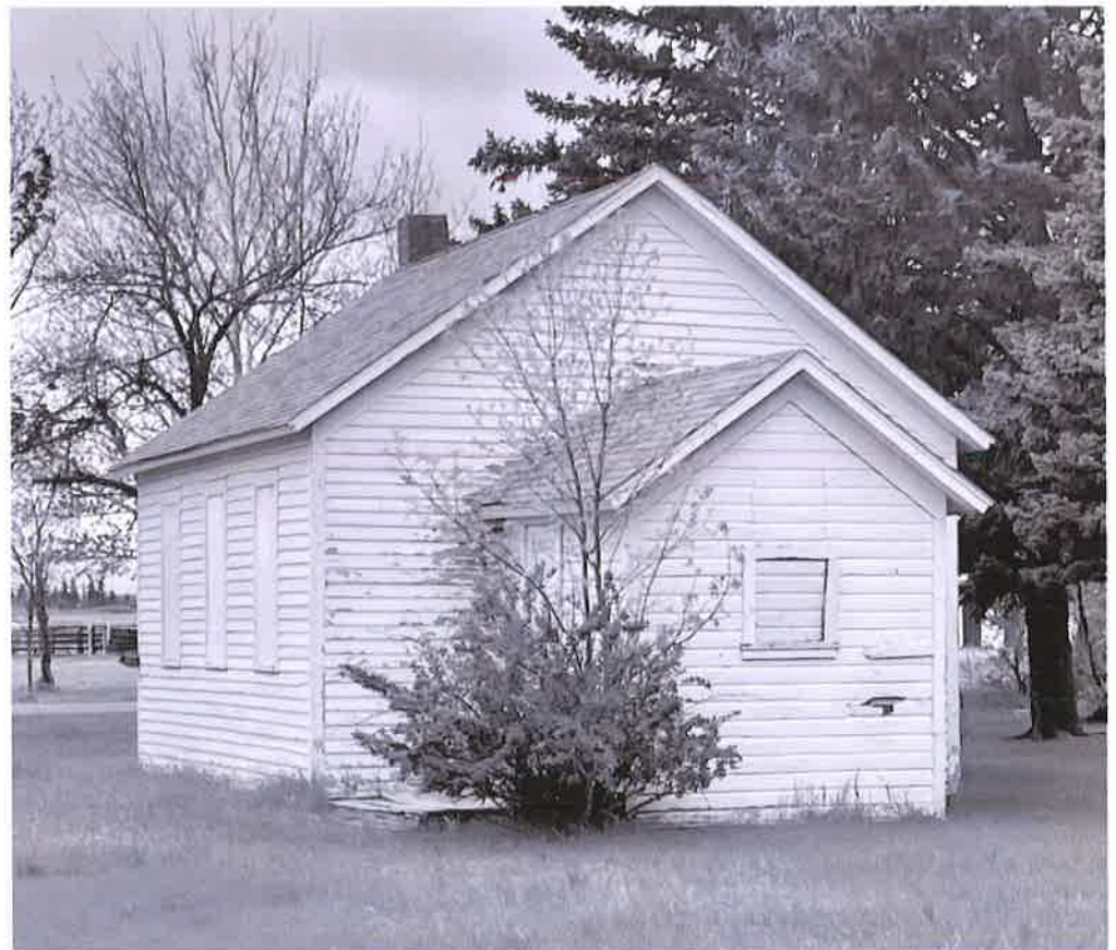
South and East Side